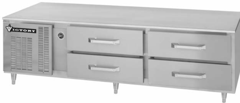
GRS-2-S7 Stainless Steel Tops are Optional

Remote Models Available (Two and Three Section Models Only)