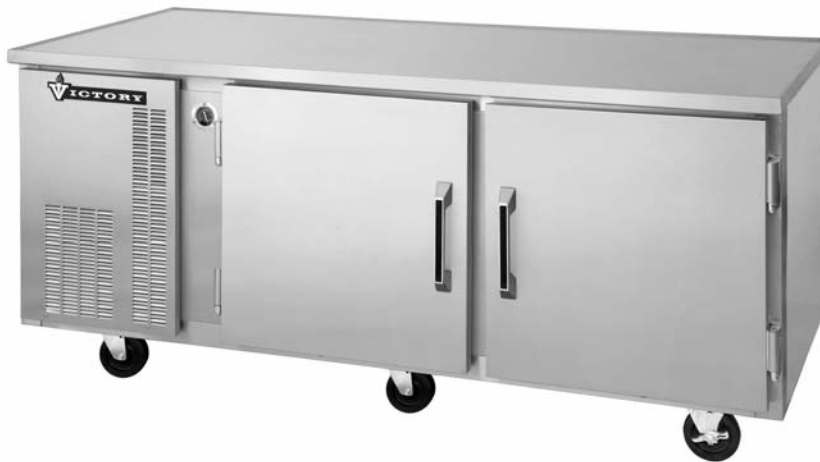
UFS-2-S7 Stainless Steel Tops are Optional

Remote Model Available (Two Section Model Only)